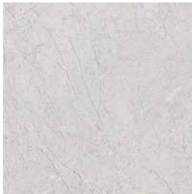
Porcelain tile Alpuan Grey