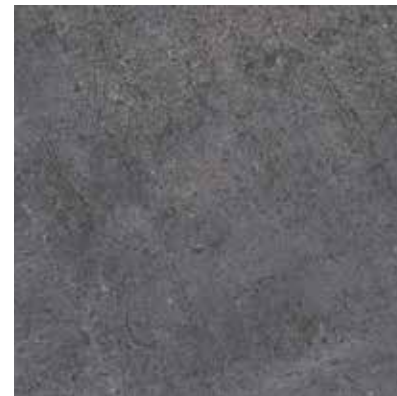
Porcelain tile Alpuan Anthracite