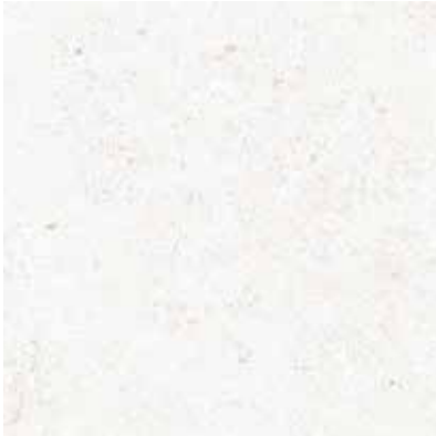
Porcelain tile Brooklyn White