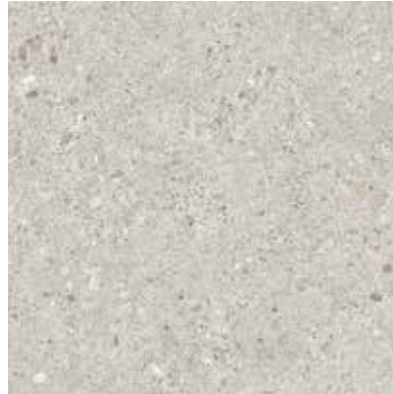
Porcelain tile Brooklyn Silver