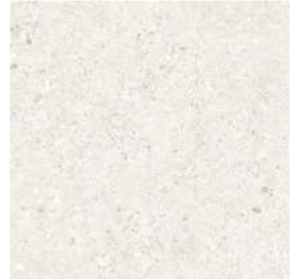
Porcelain tile Brooklyn Bone