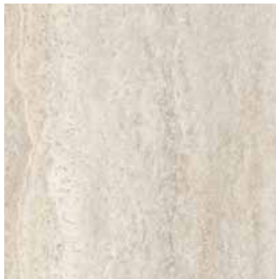
Porcelain tile Travertino Desert