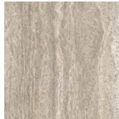
Porcelain tile Travertino Mocha