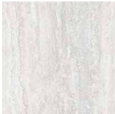
Porcelain tile Travertino Cloud